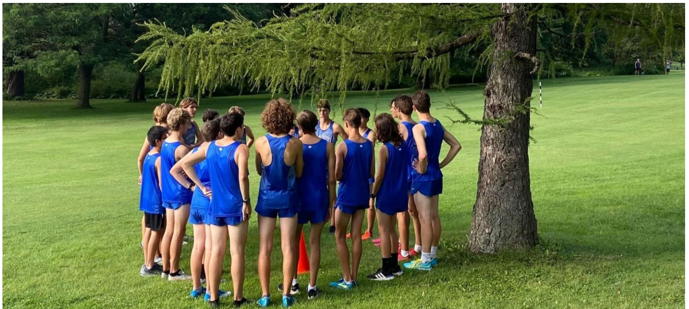
The combined boys team huddle to strategize and encourage before their victory at the Milwaukee River Invitational.